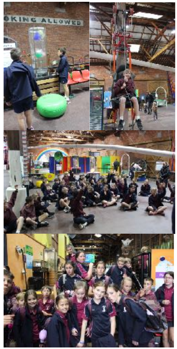
On the 25th of May we went to Bendigo to visit the planetarium and discovery centre .

There was a heap of science machines and a cool mirror maze( I definitely didn't run into a mirror) . It was pretty fun. There was vertical slide that I wish I could have went on